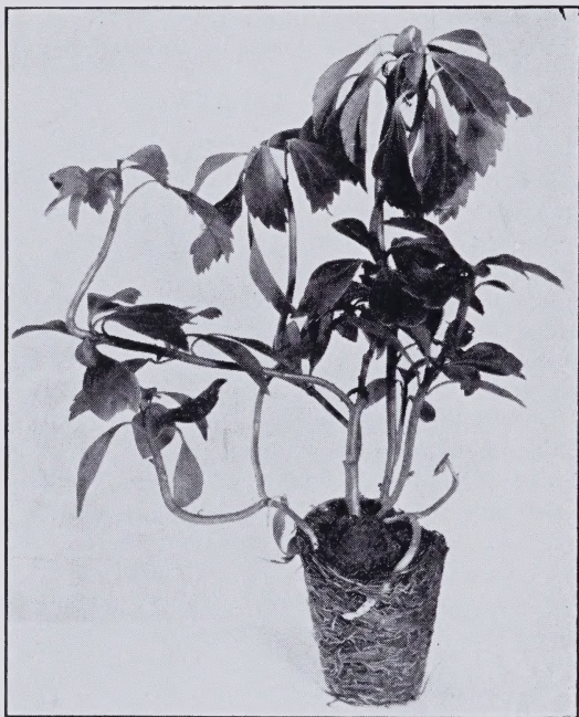
A typical plant of Pachysandra taken from a 2¼-in. pot.

Our plants are not divisions. They are grown from cuttings and have a strong, undivided root-system. Pachysandra is a true evergreen and "requires the shade of its own foliage" for best results; therefore it should be "planted closely," using young, vigorous plants in preference to large plants widely spaced. One-year field-plants, two-year field-plants, or 2¼-inch pot-plants are the proper sizes to use. We recommend 4 plants per square foot.